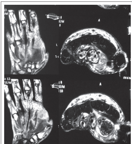
Figure 2: Magnetic resonance imaging wrist and hand showing a large peripherally enhancing cystic lesion containing multiple loose bodies involving the flexor tendons of forearm and thenar eminence of left palm.